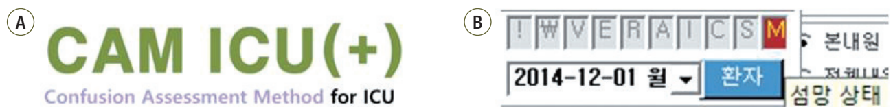
Figure 1. Delirium notification program. (A) Bedside sign: if the patient is confirmed as delirious, the intensive care unit (ICU) nursing staff attached this bedside sign under the patient identification table. When a primary care physician identifies the patient during daily rounding, he or she will see this sign. (B) Warning sign on the electronic medical record (EMR): to see the EMR of a particular patient, a physician must press the blue box. If delirium is present, the delirium warning box will be highlighted in red among a series of alert boxes located above the blue box. When the doctor moves the mouse cursor over the red box, a yellow box with the word "in delirium" will appear. The image is part of the EMR program screen currently in use. CAM: Confusion Assessment Method.

Before December 1, 2014, the results of the monitoring program were noticed when the patient's physician read the monitoring sheet on the EMR chart. To improve clinician awareness of their patient's delirium and distress status, two simple methods of notification have been used since December 1, 2014. First, a sign was placed bedside that read "CAM (+)" so that the doctor could observe it when conducting daily ICU rounds. Second, a warning sign was inserted onto the first screen when the physician read the patient's EMR to prescribe, record, or check test results (Figure 1). Physicians were also provided with an electronic chart of the patient's delirium, anxiety, and pain status in a single table, organized by date.